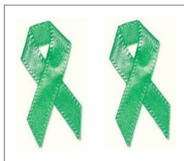
Mental Health Awareness Ribbons