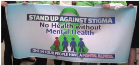
Large Banner for main road