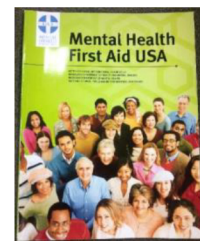
Mental Health First Aid Training Book