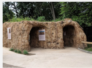
The new exhibit design gives

The Bergen County Zoo is happy to report that the construction for the new prairie dog exhibit has been completed. We are excited to have a new home for our prairie dogs and are eager to see them enjoy it. Currently the prairie dogs are located underground and are in the midst of burrowing their new tunnels and reestablish their colonies.