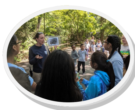
To the Left: Conducting a tour with a school