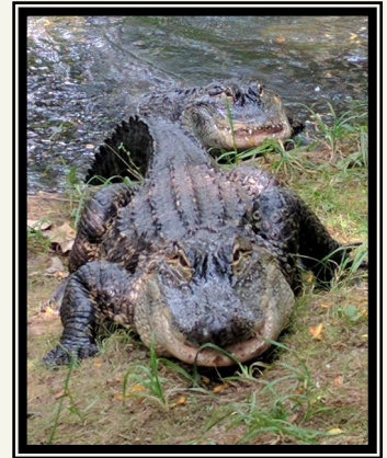
American Alligators on Exhibit

From Memorial Day–Labor Day you can observe Alligator feedings with a keeper chat at the alligator exhibit on Sundays & Tuesdays at 3pm.