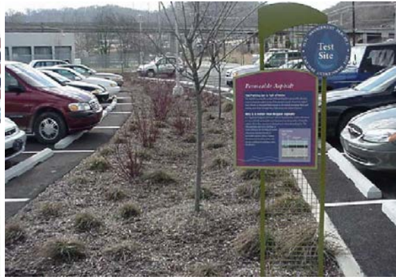
Bioretention swale in a parking area