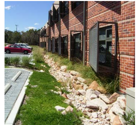
Permeable parking lot and bioretention for commercial buildings