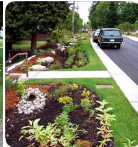
Bioswale along a Residential Street