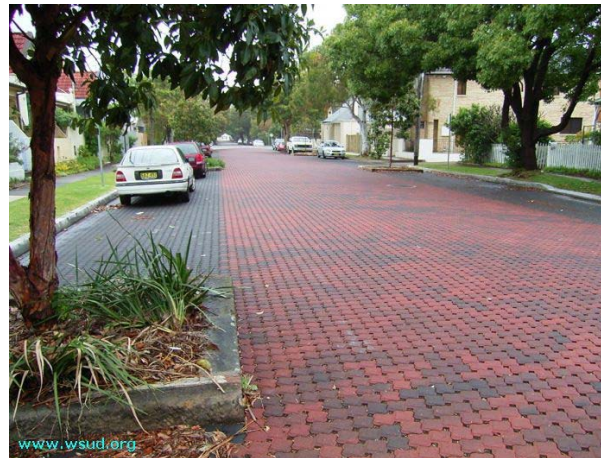
Permeable paver retro-fit for a residential street