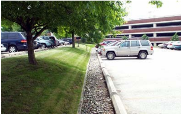
Infiltration beds in a parking lot