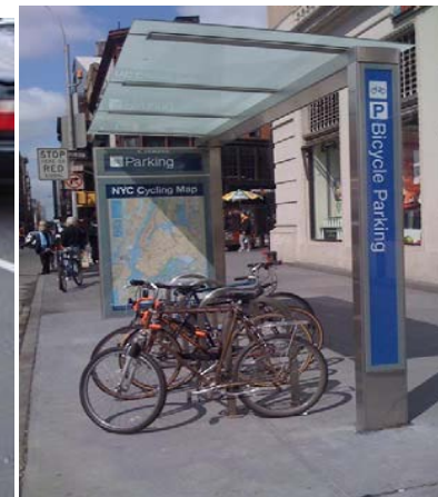
Bicycle parking and shelter