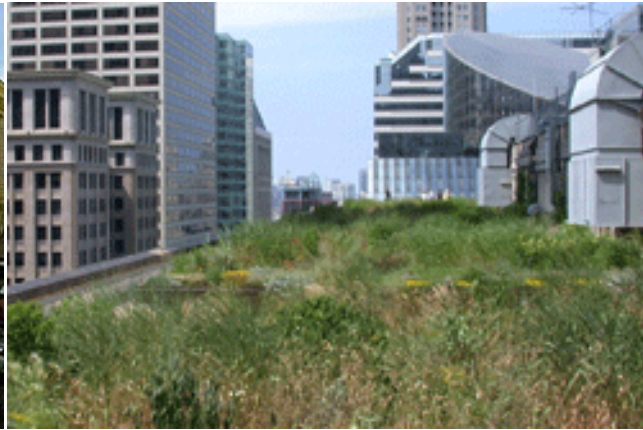
Green Roof in a dense urban setting