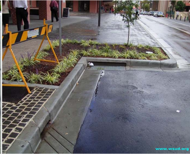
Street tree stormwater treatment retro-fit