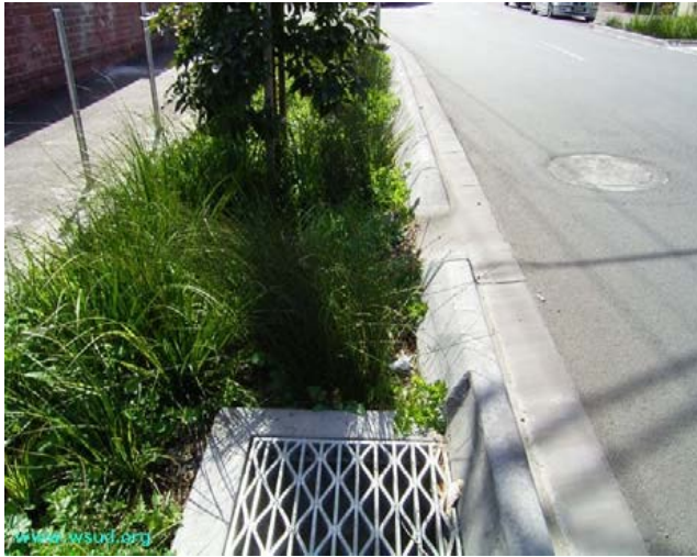
Bioretention swale retro-fit to roadway