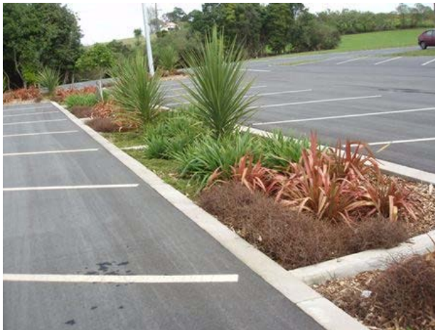
Rain Garden in Parking Lot