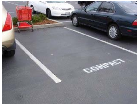
Parking stalls for compact vehicles