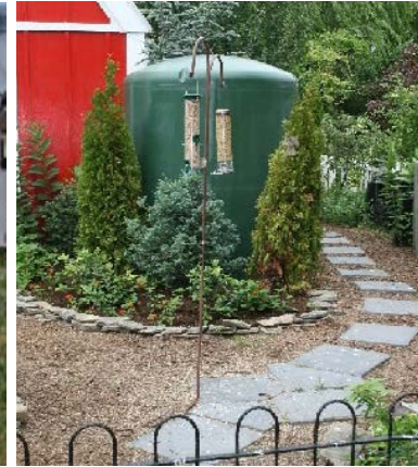
Rainwater captured in a cistern