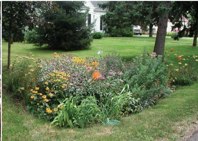
Rain Garden on Residential Property