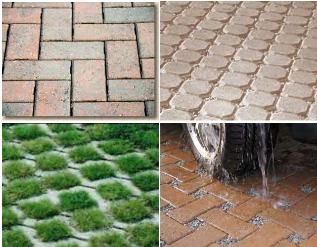
Permeable paving options