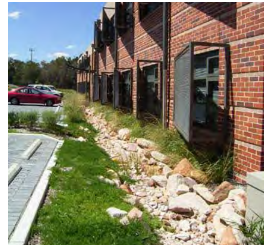
Permeable parking lot and bioretention for commercial buildings