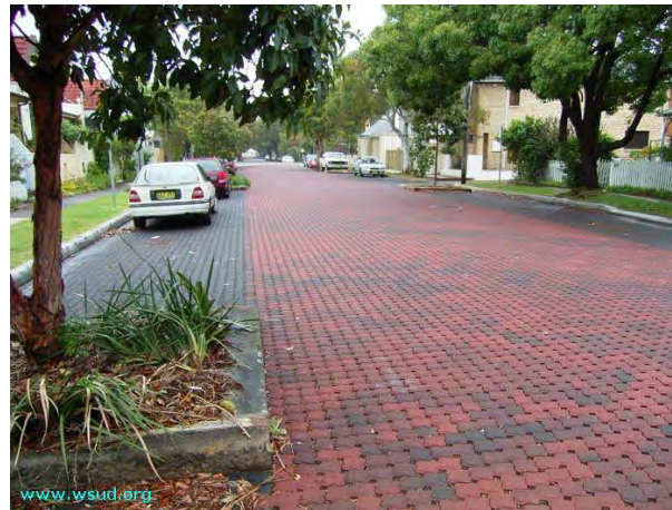
Permeable paver retro-fit for a residential street