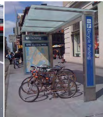
Bicycle parking and shelter