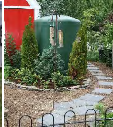
Rainwater captured in a cistern