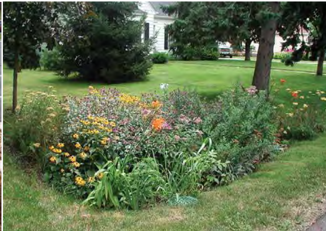
Rain Garden on Residential Property