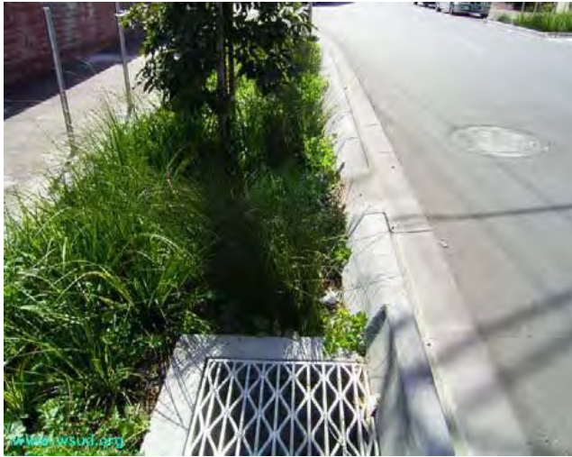
Bioretention swale retro-fit to roadway