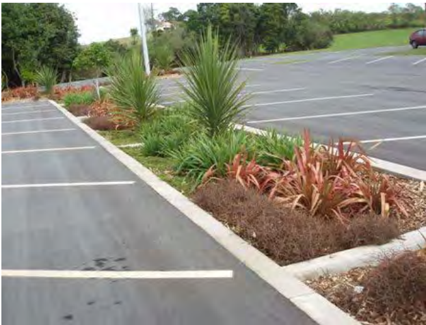
Rain Garden in Parking Lot