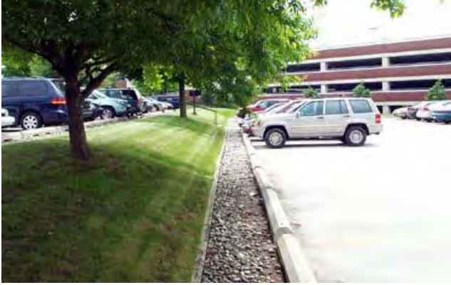
Infiltration beds in a parking lot