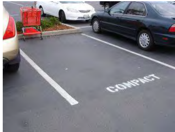
Parking stalls for compact vehicles