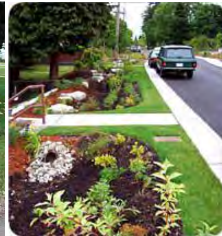
Bioswale along a Residential Street