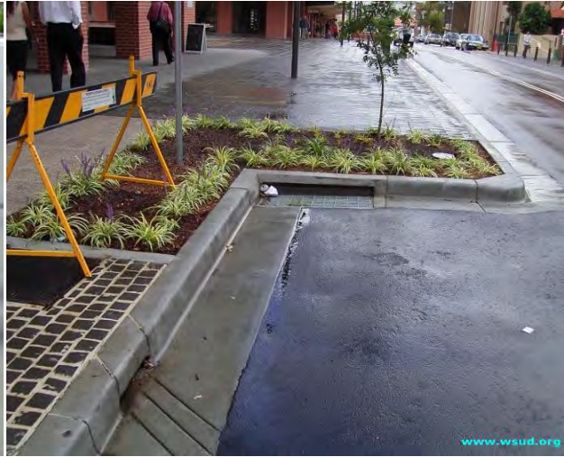
Street tree stormwater treatment retro-fit