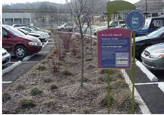
Bioretention swale in a parking area