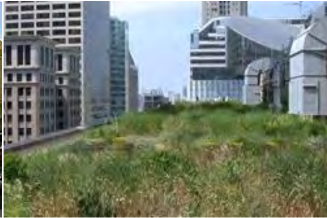
Green Roof in a dense urban setting