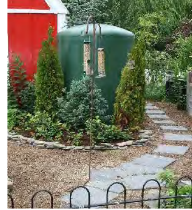
Rainwater captured in a cistern