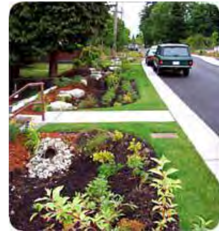
Bioswale along a Residential Street