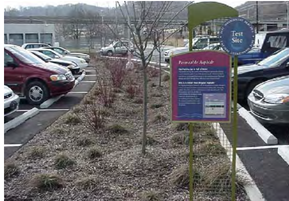
Bioretention swale in a parking area