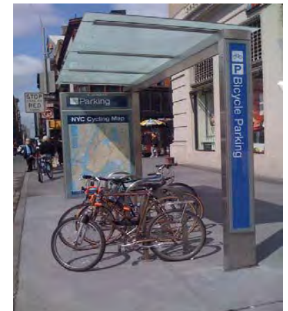
Bicycle parking and shelter